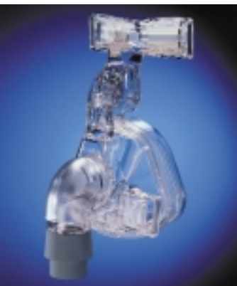
Ultra Mirage Mask

In choosing from the Mirage or Ultra Mirage Mask ranges, you can be confident that your mask and machine combination has been designed to deliver optimal and comfortable therapy.