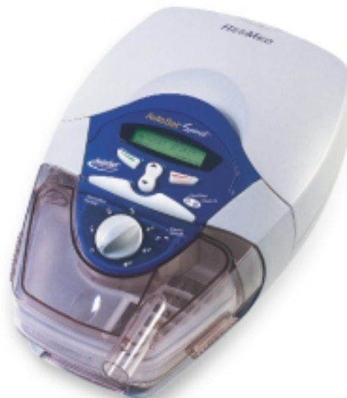
AutoSet Spirit with HumidAire® 2i

If you need to get up in the night, the SmartStart® option senses when you have removed the mask and automatically turns the machine off. Once you replace the mask and take a breath, it gently commences again. This simply means you don't have to fumble in the dark for the control panel.