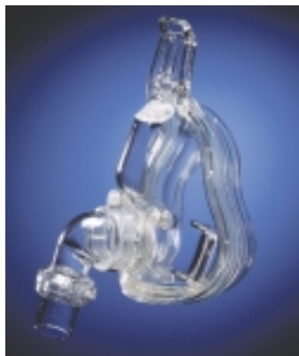
Mirage Full Face Mask