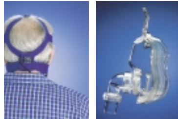
▲ Circular headgear cups the crown of the head